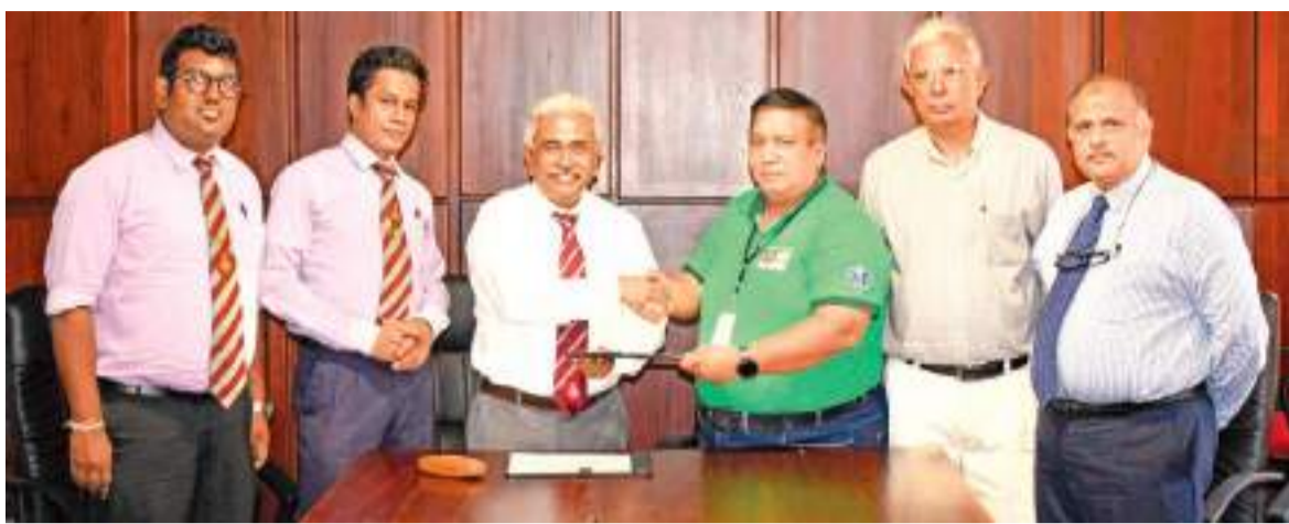
Sri Lanka Medical Association and 1990 Suwa Seriya Foundation officials at the signing of the Memorandum of Understanding.

This partnership has served the nation at critical phases of the COVID-19 pandemic in Sri Lanka. The Sri Lanka Medical Association (SLMA) in collaboration with 1990