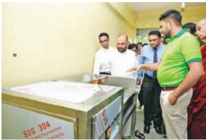
Agriculture Minister Mahinda Amaraweera during a recent inspection tour of the Potato Chips processing factory at Kahattewela in Bandarawela.

"Potato cultivation is currently in progress in Welimada and Nuwara Eliya as well as the Badulla areas which enabled the setting up of the Potato Chips Factory in the Bandarawela