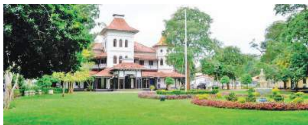
College House, University of Colombo

The Association has several key objectives including Student Welfare, Student Development, Member Engagement and Fellowship. The Members of the Association as Thought Leaders of the