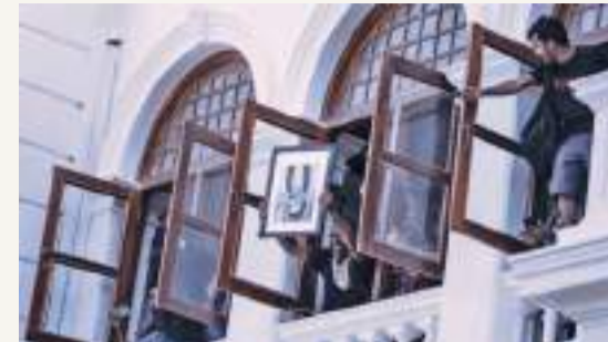
One of the pictures taken during the Aragalaya period.