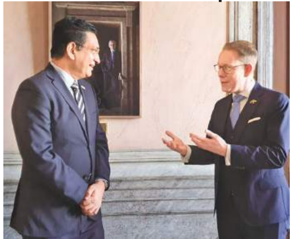
Foreign Minister Ali Sabry, PC held talks with his Swedish counterpart Tobias Billström in Stockholm on Thursday to further advance the decades old bilateral engagement. Discussions placed emphasis on bolstering all areas of bilateral interest especially economic engagement.