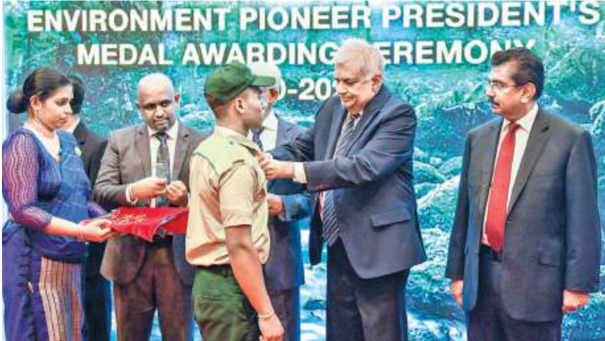
President Ranil Wickremesinghe with a recipient at the 10th Environment Pioneer President's Medal Awarding Ceremony 2020-2021 held at the BMICH.

"As a former Government Minister in 1970, I remember allocating 150,000-200,000 acres on the side of Polonnaruwa to start the Mahaweli movement. Today, people are living in those areas, and we have become