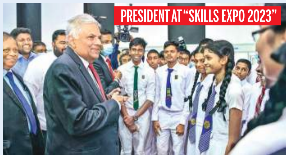
PRESIDENT AT "SKILLS EXPO 2023"

The exhibition will be held at the Sirimavo Bandaranaike hall, at BMICH Premises on May 12, 13 and 14 TO PAGE 02