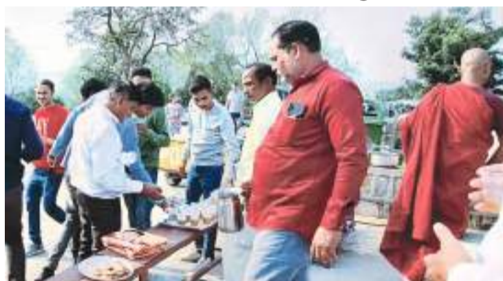
A Dansasa was held at the Sanchi Chethiyagiri Viharaya in Gopal, India on Vesak Poya Day.