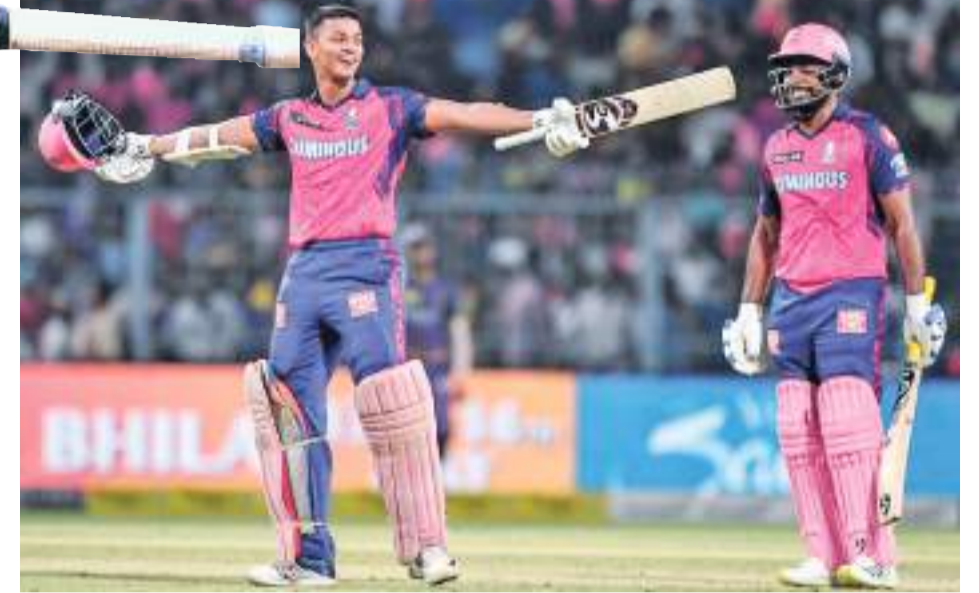
Yashasvi Jaiswal (left) of Rajasthan Royals celebrate their victory

Leg-spinner Yuzvendra Chahal took a four-wicket haul and Yashasvi Jaiswal hammered a record-breaking half century as Rajasthan Royals cruised to a smashing nine-wicket victory over Kolkata Knight Riders (KKR) in the 56th match of the Indian Premier League (IPL) played at the Eden Gardens in Kolkata on Thursday.